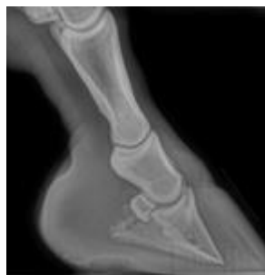
X ray from a laminitic pony showing dropping and rotation of the pedal bone